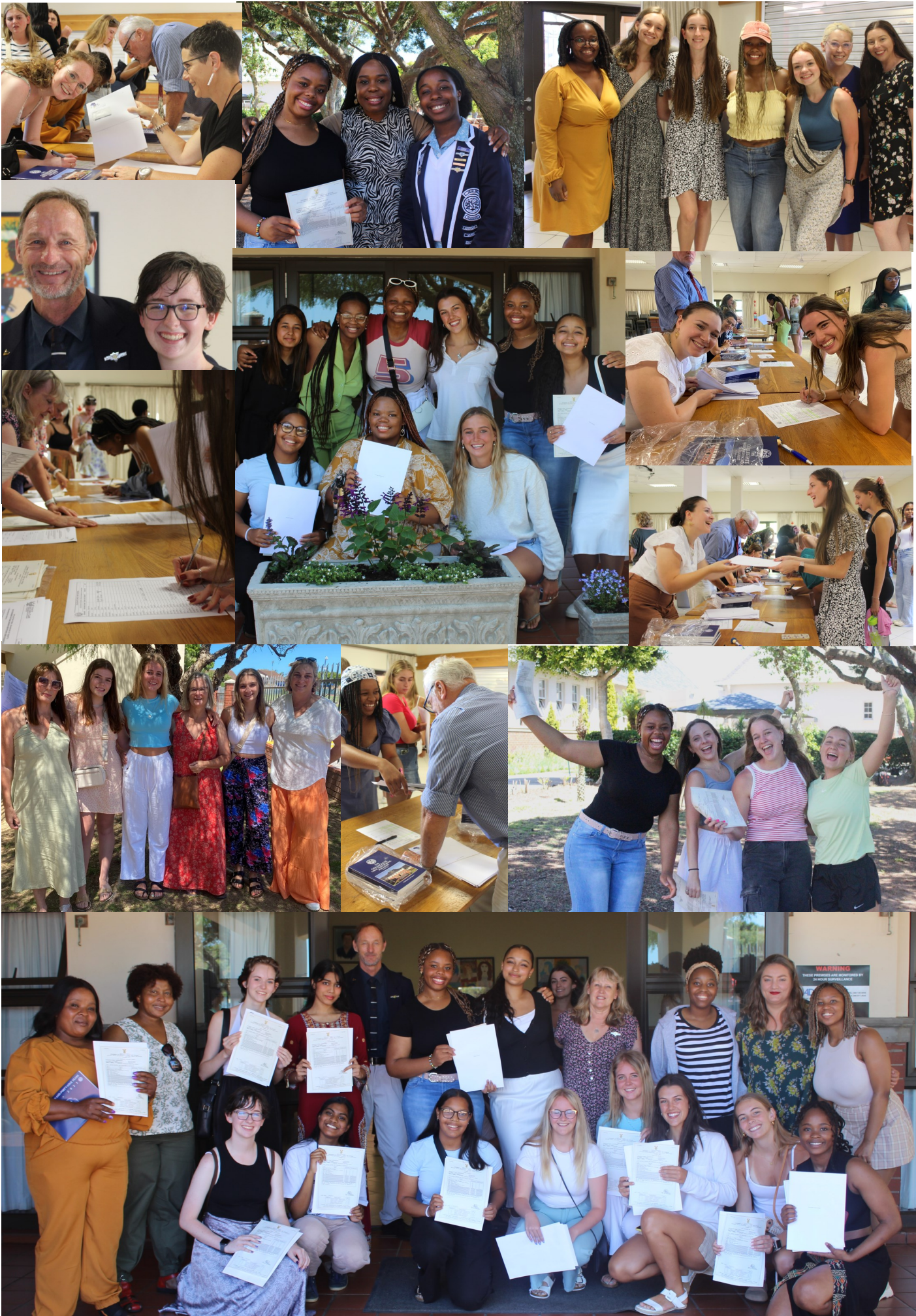
EXCELLENCE ACHIEVED THROUGH HOLISTIC EDUCATION.