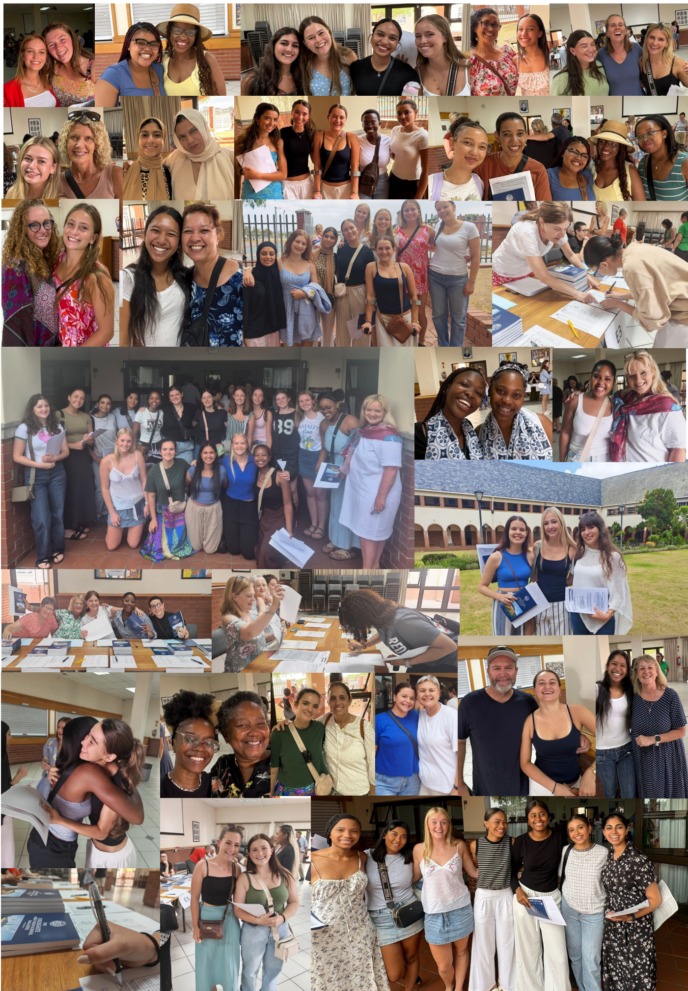
EXCELLENCE ACHIEVED THROUGH HOLISTIC EDUCATION