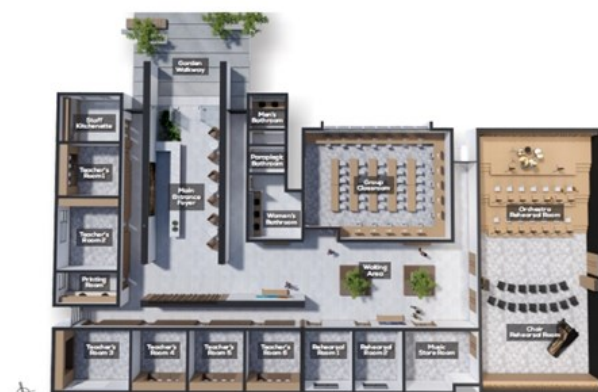
Ground Floor Plan Perspective