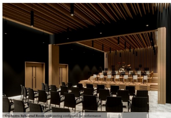
Orchestra Rehearsal Room with seating configured for performance

To find out more, watch the fly-through and to donate, visit: