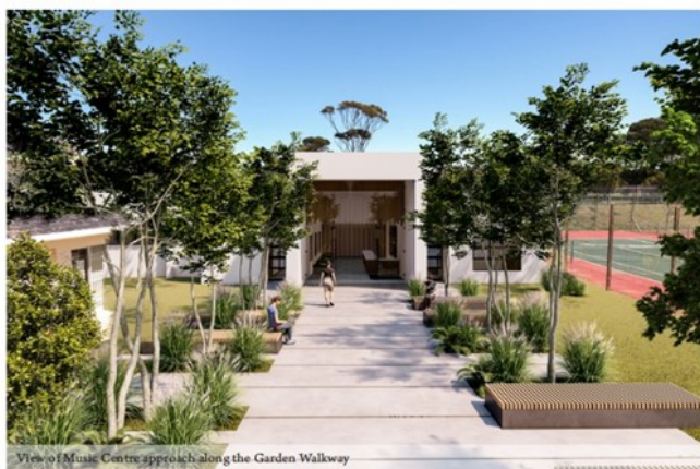
View of Music Centre approach along the Garden Walkway